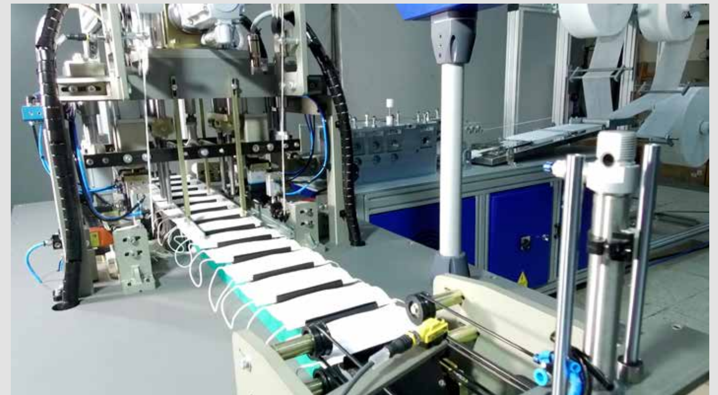
Mask machine produced with 30 years of experience, ergonomic design and products having today's latest technology