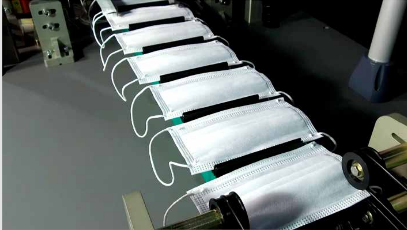
Production of superior quality products