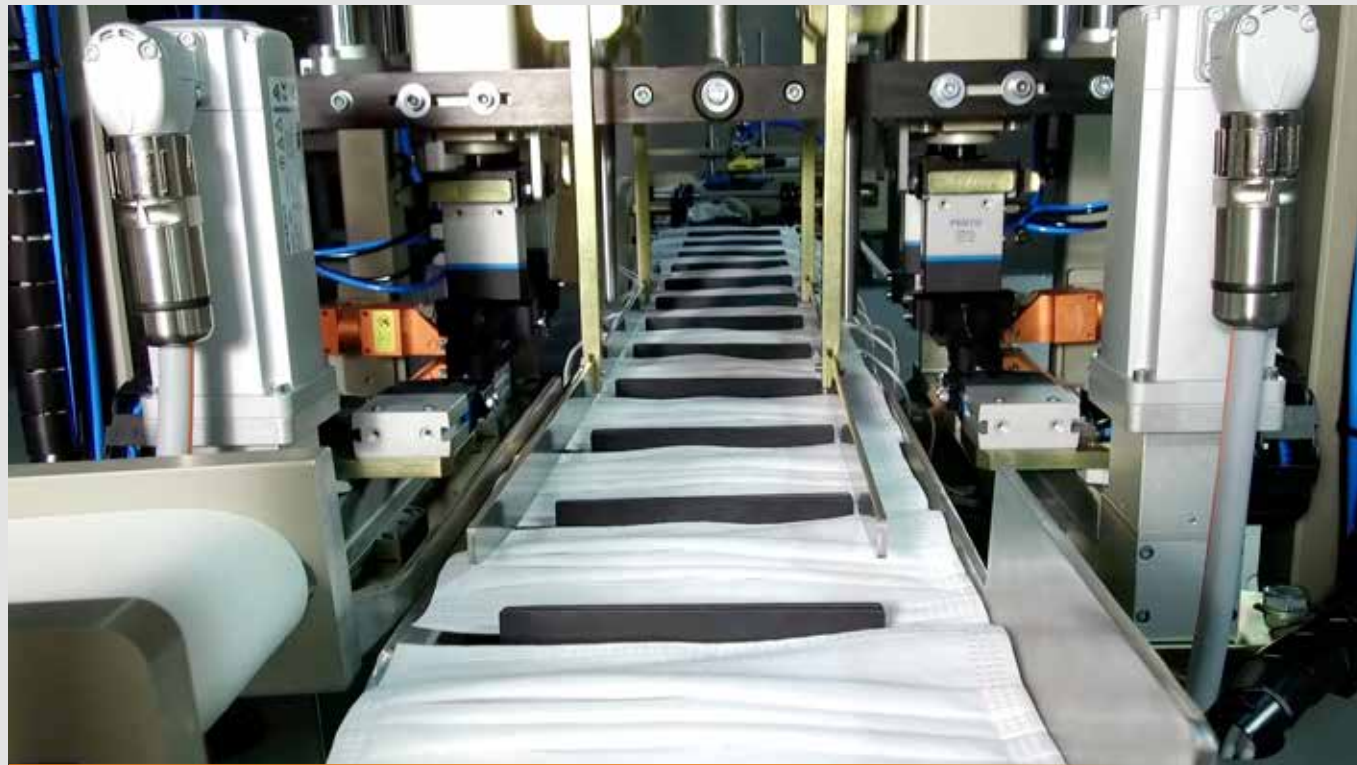
Superior motion control with cutting edge servo systems